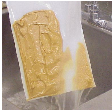
In peanut butter testing, Teflon® PFA comes clean...

Results. When placed under the water tap, both the plain and water-blended egg whites washed away almost immediately. No residue was detectable to the naked eye.